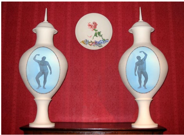
The Communicating Vessels (Detail). 2008. Video installation. CIRCA Gallery, Montreal. Pair of porcelain vases (99 x 40 cm.), earthenware dish (36 cm/dia.), antique Empire style secretary, wallpaper, ancient carpet, electric and electronic equipment and multiple video projections.

and for his own representation in the video work, in which he figures as the main character. While likenesses may vary, both the vases and the video are self-portraits.