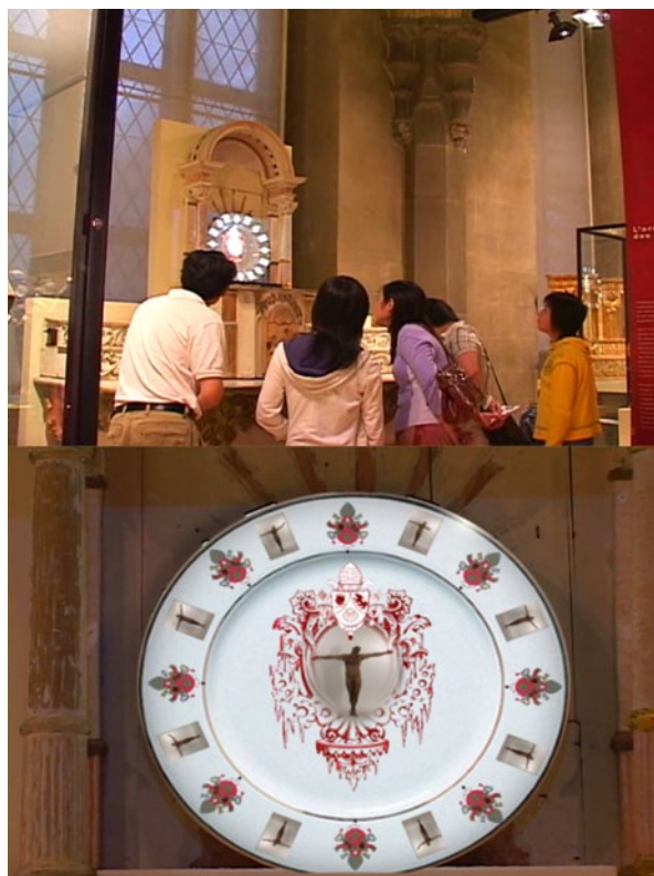
Christ's Plate . 2007 Site-specific video intervention in the sacred art collection of the Musée des Maîtres et Artisans in Montreal. Porcelain plate (41 cm/dia.), video projection.

du Québec, 23–27 May, 2007 and at the Musée du Château Dufresne , 31 May to 3 June, 2007 (part of the requirement for the masters in visual and media arts at UQAM).