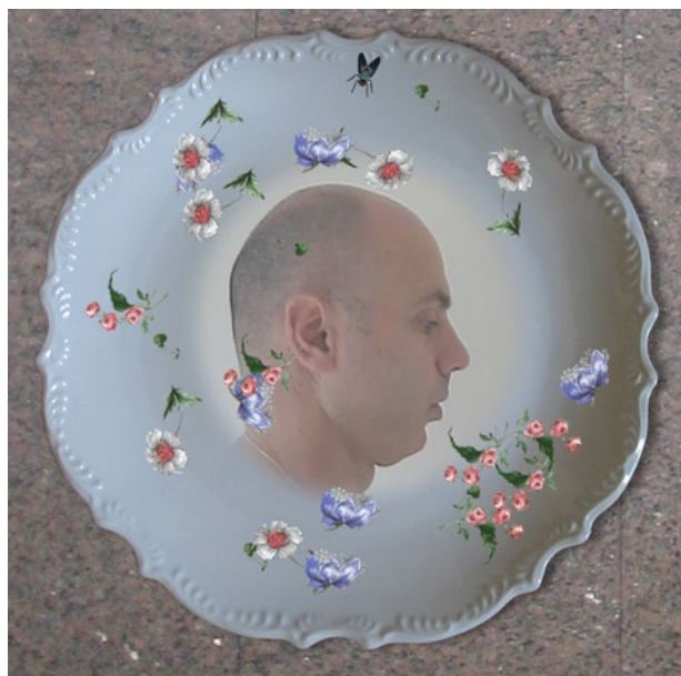
Your Breath That Passes Through (Detail) , 2009.