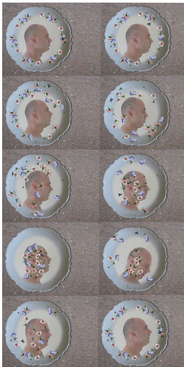
Your Breath That Passes Through , 2009. Video intervention held during the Montreal High Lights Festival. Porcelain plate and video projection. 40 cm/dia.

Decorative objects played a crucial role in Les Vases Communicants , his most recent gallery exhibition. Reconstructed in the small exhibition hall was part of a well-to-do living or office space. Two porcelain copies of Sevres vases stood on an Empire style secretary; above it, a white faience dish hung on a background of red wallpaper whose vine tendril motifs acted as