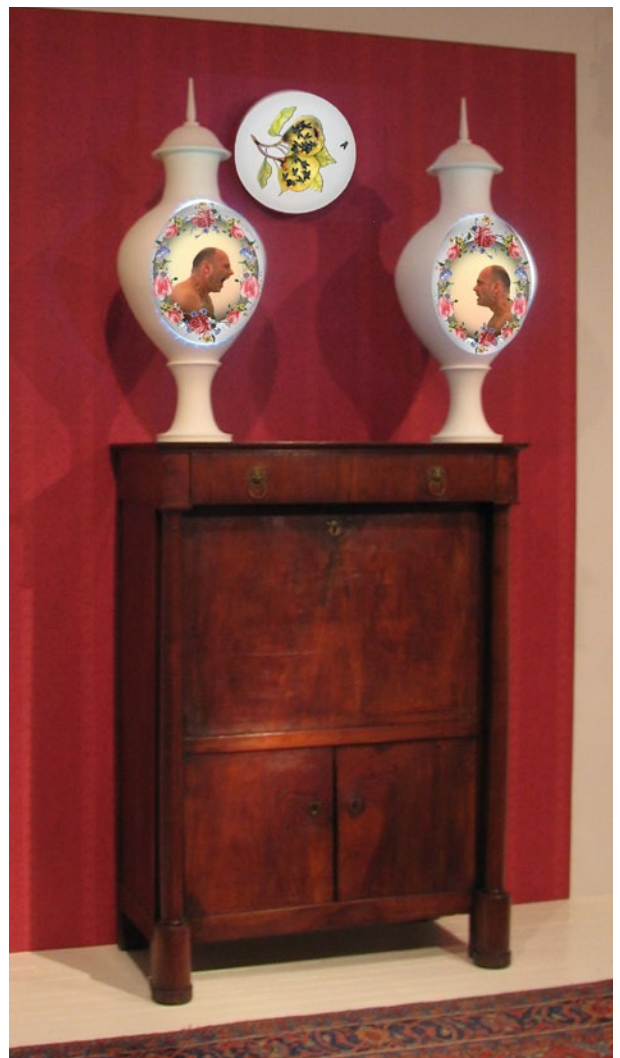
The Communicating Vessels. 2008. Video installation. CIRCA Gallery, Montreal. Pair of porcelain vases (99 x 40 cm.), earthenware dish (36 cm/dia.), antique Empire style secretary, wallpaper, ancient carpet, electric and electronic equipment and multiple video projections.

The presence of the house as a third sequence breaks with the content of the other two; one might have expected a variation on the theme of decomposition